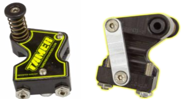
REAR HOESHOT B BASE